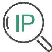
IP Check Tool